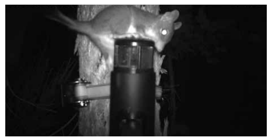
A brush-tailed phascogale is caught on camera trying to get at the bait of peanut butter, oats and golden syrup. As a result of this successful sighting the Campaspe Valley Landcare Group is now purchasing its own cameras to continue surveying for phascogales, and inmates of Loddon Prison will make 20 nestboxes for the group.