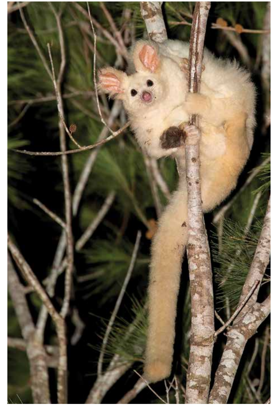
Greater glider (Petauroides volans).