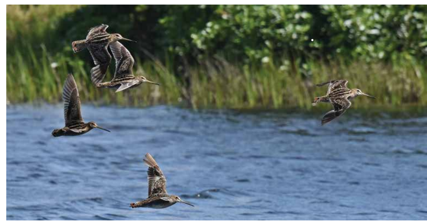
Latham's snipe arriving in south-west Victoria.