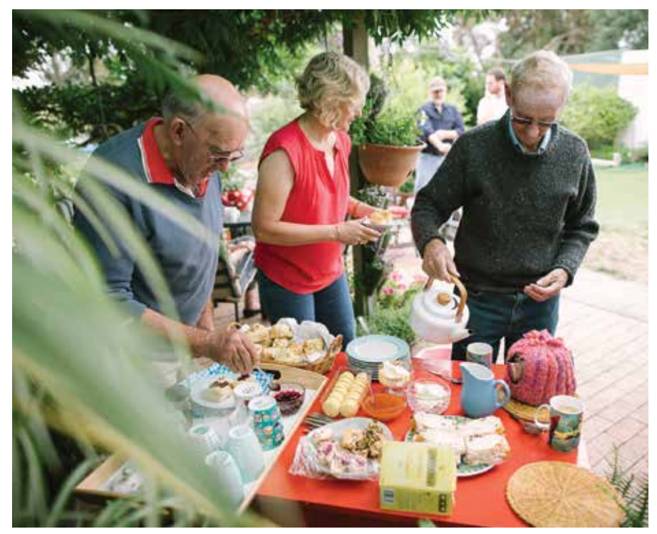
Members of Merriman Creek Landcare Group gather around for the important morning tea.

The focus of the research project was to investigate how much social benefit (in dollar terms) would be derived from each dollar of investment from government funding.