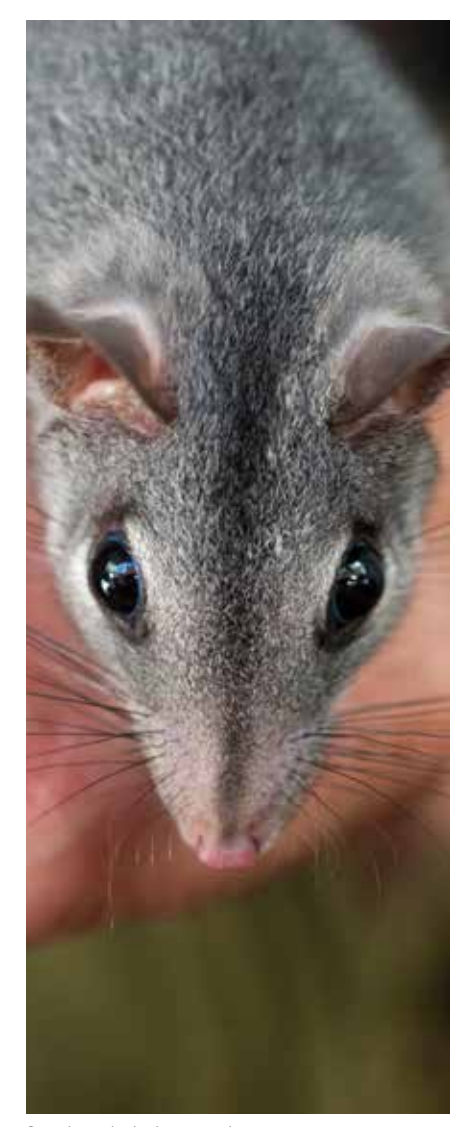
Brush-tailed phascogale (Phascogale tapoatafa).