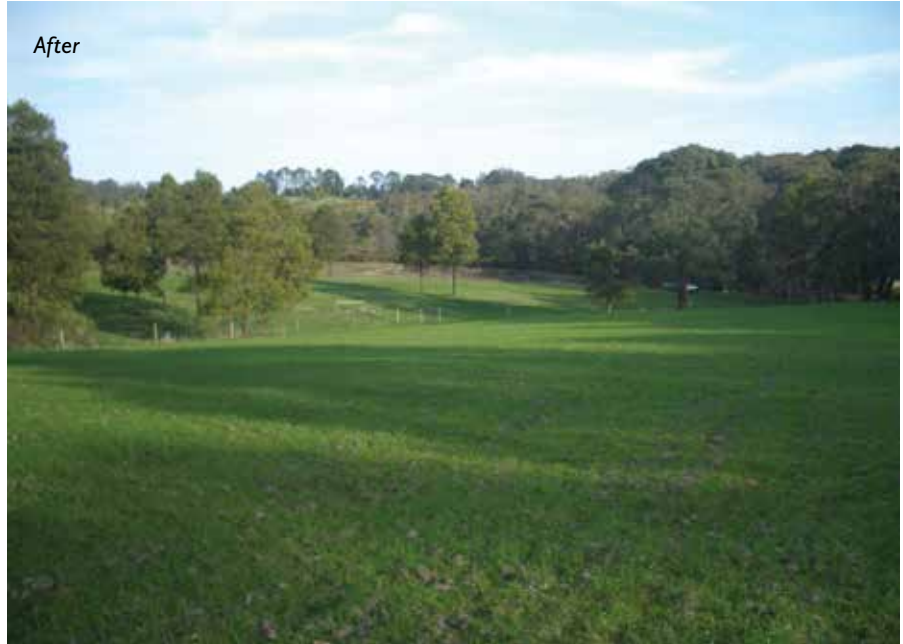
Before and after gorse control works at one of the Woady Yaloak Catchment Group's participating properties at Staffordshire Reef.