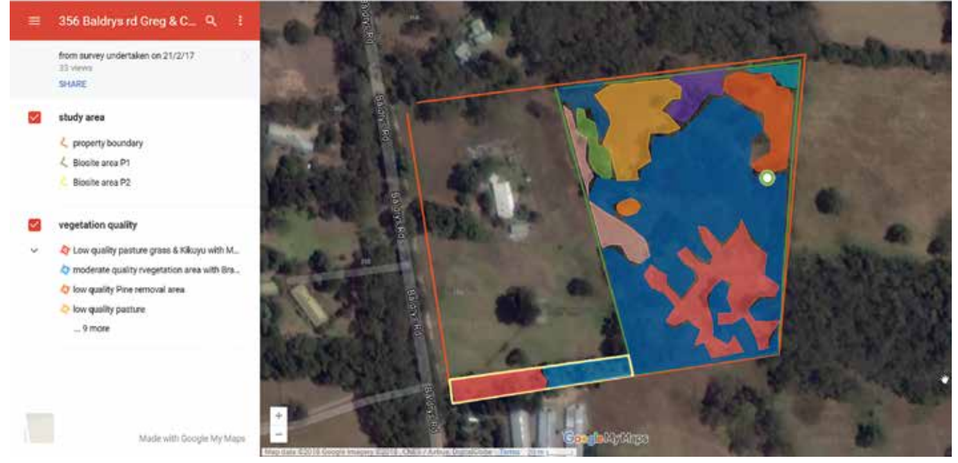
Vegetation quality assessment of a property in the Greens Bush to Arthurs Seat Biolink by Gidja Walker in Feburary 2017. This map of the property shows how additional detail can be provided in the legend using different colours. The maps were popular with landholders, who could see the benefits of mapping over time.

Category 2: Blue. Areas of bushland with moderate infestation of exotics and/ or invading native alien species. Average indigenous cover 50–75 per cent.