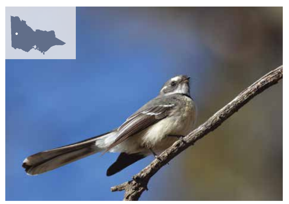
A grey fantail found foraging during autumn in six-year-old revegetation.

Project Hindmarsh is the vision of the Hindmarsh Landcare Network, and it aims to build a biolink between the Little Desert and Big Desert in western Victoria. The project has been going since 1998 and has seen more than four million trees and shrubs planted on roadsides and private property in the Hindmarsh and West Wimmera Shires.