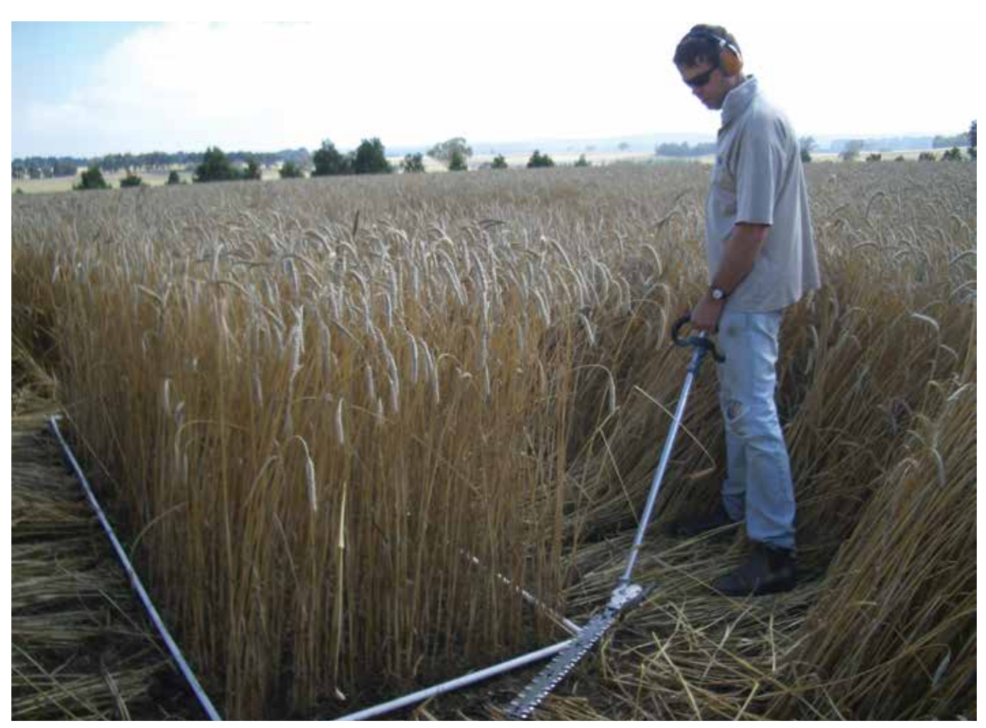
Harvesting a trial plot. The Woady Yaloak Catchment Group's research showed that pig and poultry manure was as good as conventional fertiliser, depending on the rate applied.

More information and results from the testing are available on the Woady Yaloak website. Go to www.woadyyaloak.com.au