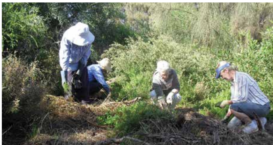
Dedicated volunteer members of the Black Rock and Sandringham Conservation Association undertake delicate weed control in the coastal bushland along Black Rock foreshore.