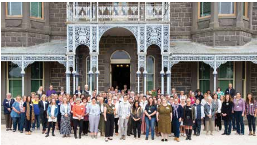
More than 120 women attended the Corangamite Rural Women's Forum at Barwon Park Mansion, Winchelsea, in March.

Landcare staff joined North Central and North East CMA regions at the Northern Rivers Roundup for joint training and peer learning. The workshops covered strategic planning, how to access corporate funding and how to write press releases. Peer learning sessions demonstrated the pitfalls that some Landcare facilitators have encountered in the delivery of projects. Feedback has been positive and we are planning a 2020 event in the North East region.