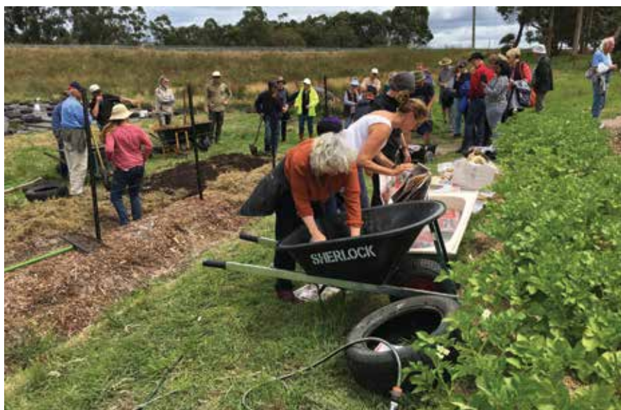
The launch of the River Garden at Bass in December 2017 with more than 60 people in attendance.