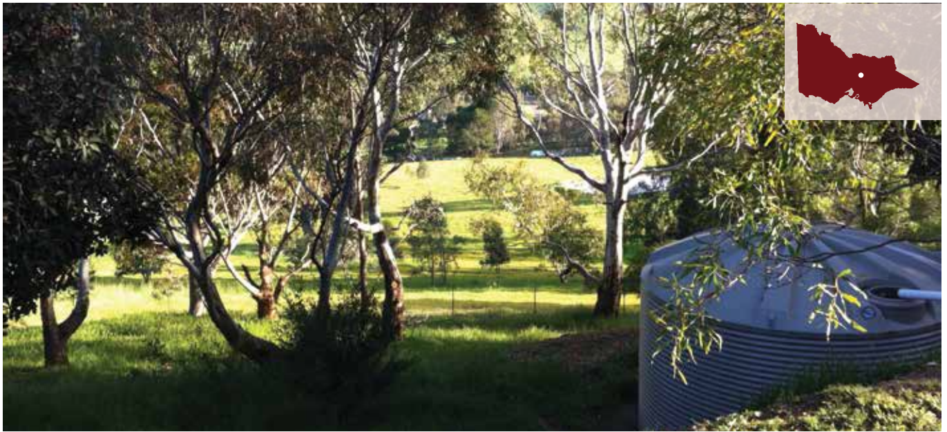
The view from the mud brick house on our property at Bonnie Doon. Working on the land has given us feelings of satisfaction, pride and achievement.

group were matched (by age and gender) with 51 controls, many of whom were involved in volunteering but not in the natural environment.