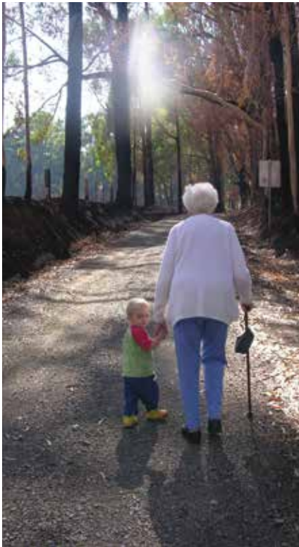
Social ties and a connection to nature were important factors for recovery after the 2009 bushfires.

In the wake of the Black Saturday bushfires in 2009, the Victorian community was faced with the urgent need to learn more about how to support those affected so we can improve recovery processes in the event of another disaster.