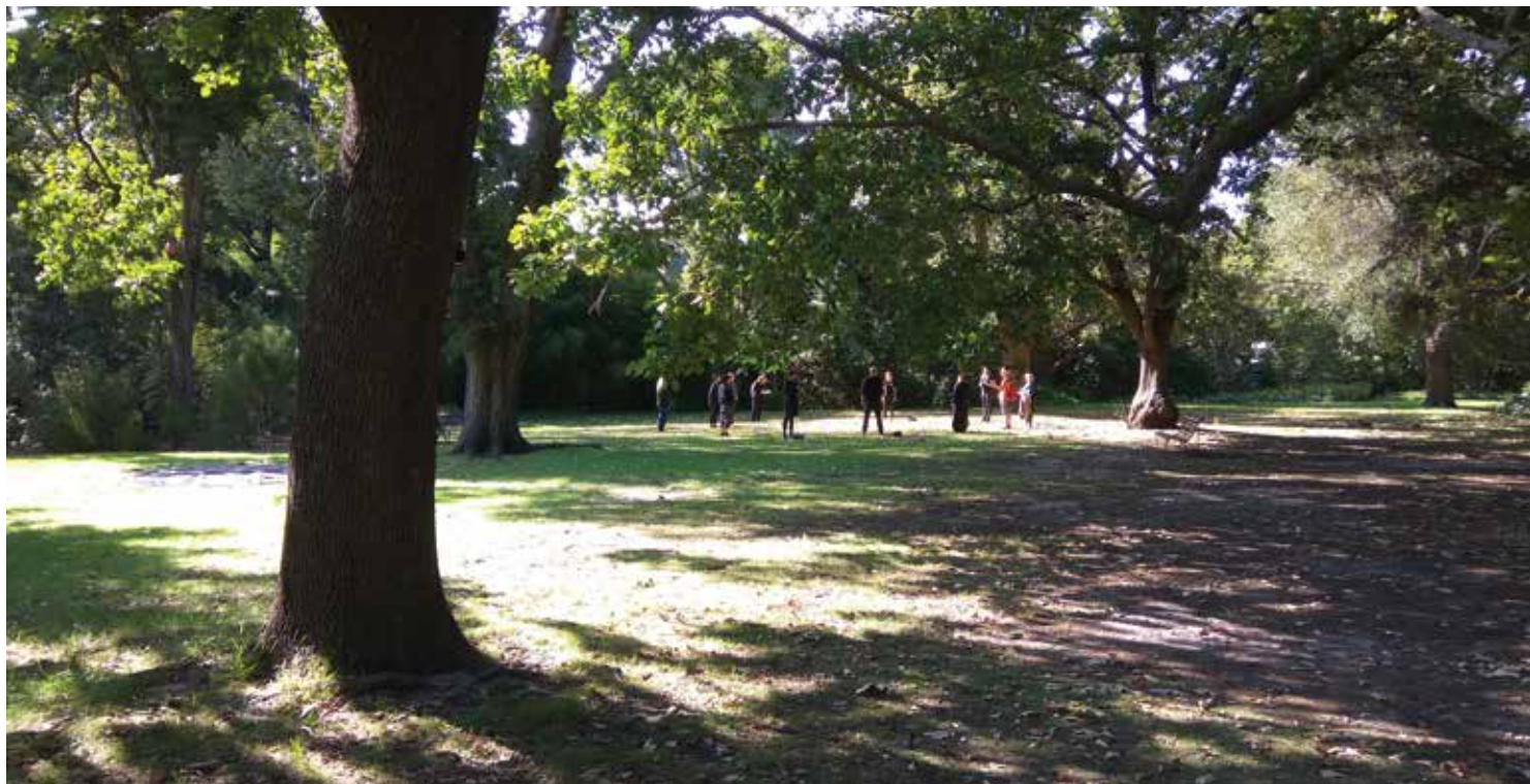
Participants slow down by tuning their senses during a forest therapy walk at the Melbourne Royal Botanic Gardens early 2019.