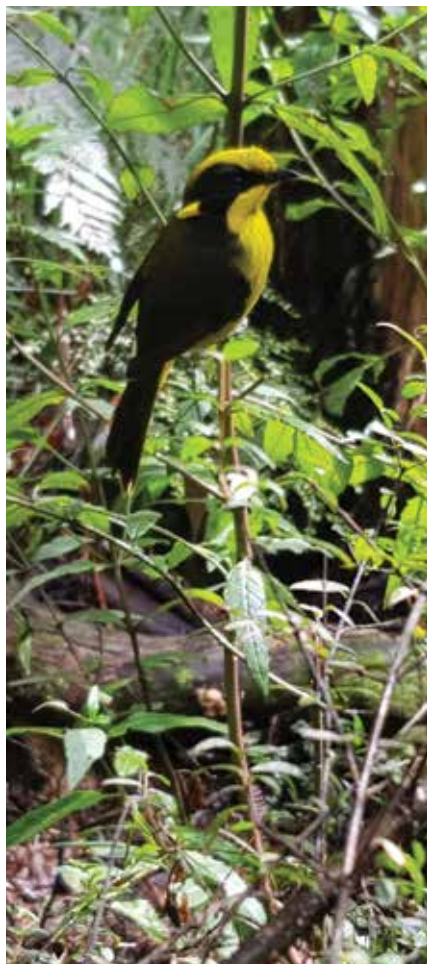
A helmeted honeyeater at Yellingbo.

The helmeted honeyeater is the avifaunal emblem of Victoria. It is a critically endangered subspecies of the yellow-tufted honeyeater and is a flagship taxon for the health of swamp and streamside vegetation. Threats such as habitat loss and degradation, predation and competition of native and introduced species have resulted in significant declines in the population range and numbers of the species.