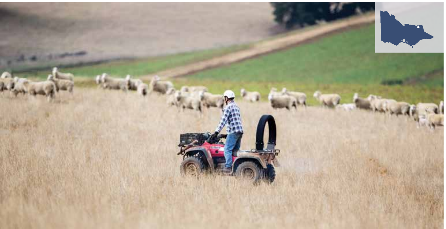
A quad bike user wearing a helmet on a bike that has been fitted with an operator protective device.