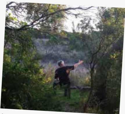
A sit spot exercise during a forest therapy walk at Coolart Wetlands and Homestead, February 2017.

INFTA is registered in Victoria as a not-for-profit association. For more information email info@infata.net