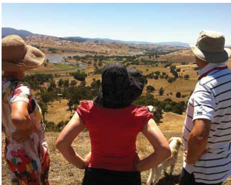
On top of the world and looking down at the trees we have planted at Boonie Doon.

A 2005 study that I led in Victoria explored the health, well-being, and social capital benefits gained by community members who are involved in the management of land for conservation in six rural communities. A total of 102 people participated in the study (64 males and 38 females). The 51 members of a community-based land management