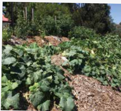
The River Garden in full summer growing glory in February 2019.