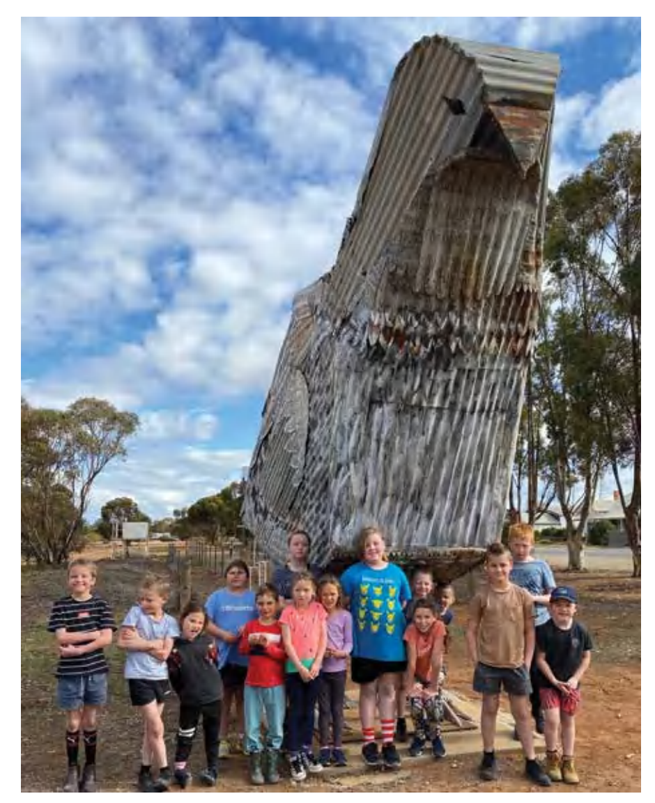
The big malleefowl at Patchewollock was a hit with students from Tempy Primary School.

The project has crossed into art as well as science with TPS students designing malleefowl emblems that they presented