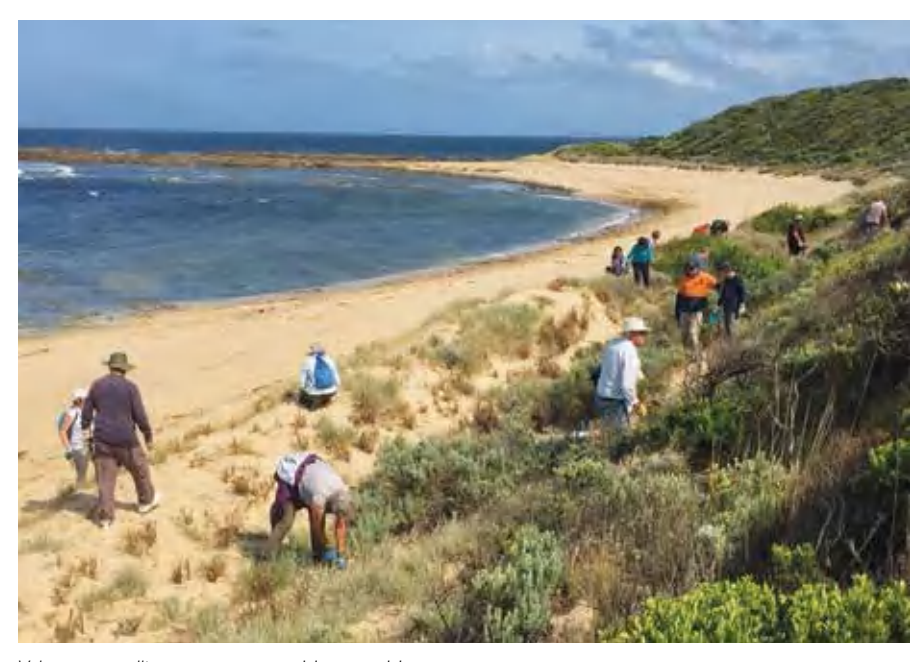
Volunteers pulling sea spurge at Harmers Haven.

By working together and independently these two groups are protecting and improving habitat along Victoria's unique and precious Bass Coast.