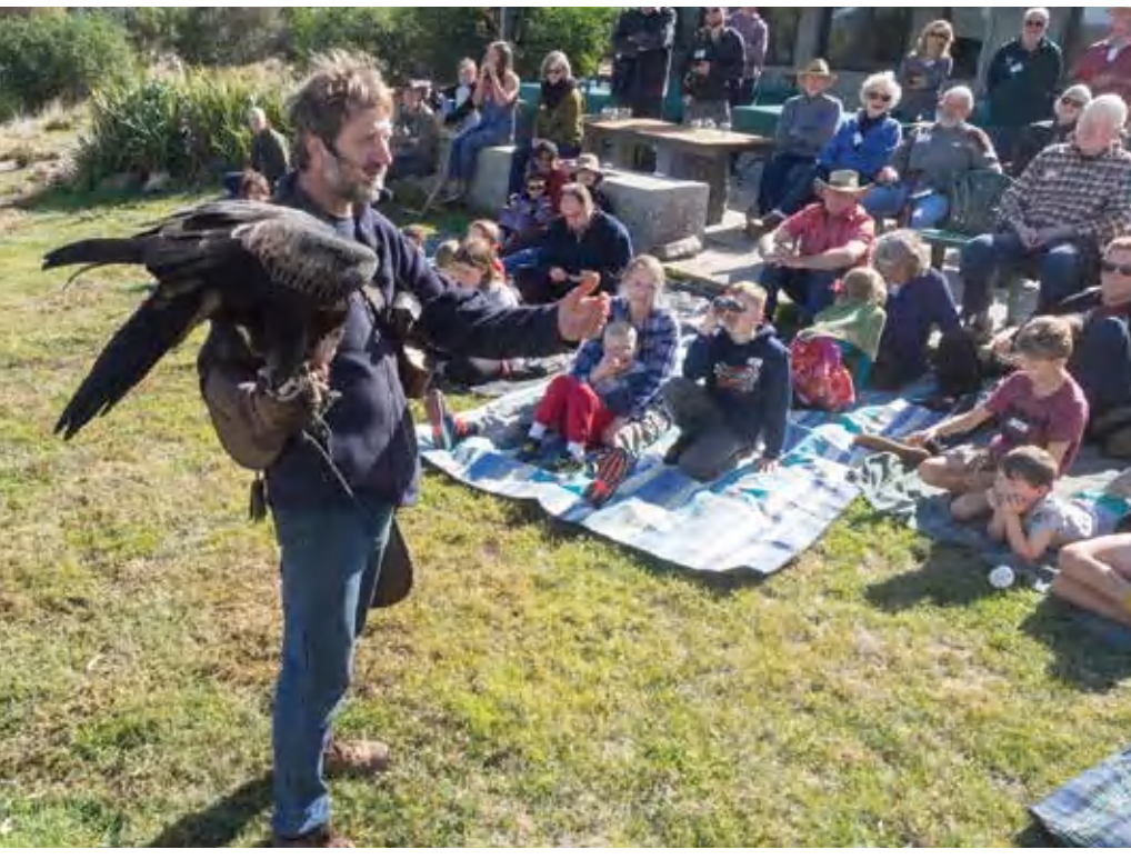
A raptor event organised by Newham and District Landcare Group in 2018 was a hit with young families.