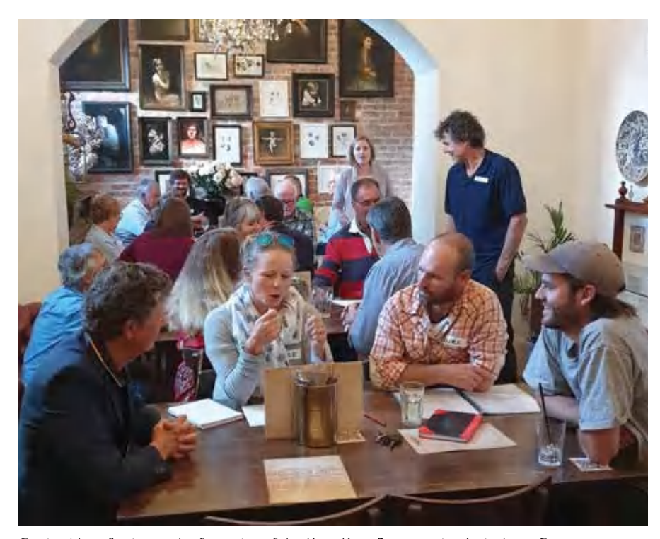
Getting ideas flowing at the formation of the Kara Kara Regenerative Agriculture Group at St Arnaud in March 2021.

Two new groups were recently established. The Kara Kara Regenerative Agriculture Group was created by the network at the request of local farming communities with a focus on soil health and biodiversity. Friends of Blue Gum Rise will work on a captive breeding program for squirrel gliders which have not been sighted in the BNGLN area since 1996.