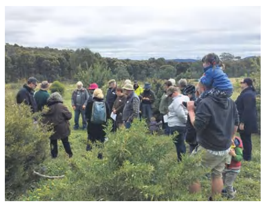
Newham and District Landcare Group members inspect biodiversity plantings at the 'Kolora' property in 2019.

The executive meets monthly and despite the challenges of an ageing committee and recent COVID-19 restrictions, members are enthusiastic about the future of the environment and the community in their beautiful district.