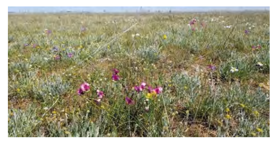
Georges Paddock on the Northern Plains Grasslands featured during the 2021 Chicks in the Sticks event.

Groups are now implementing their 2021 Victorian Landcare Grants. We look forward to hearing more about the award-worthy work being done across our landscapes, farms and communities.