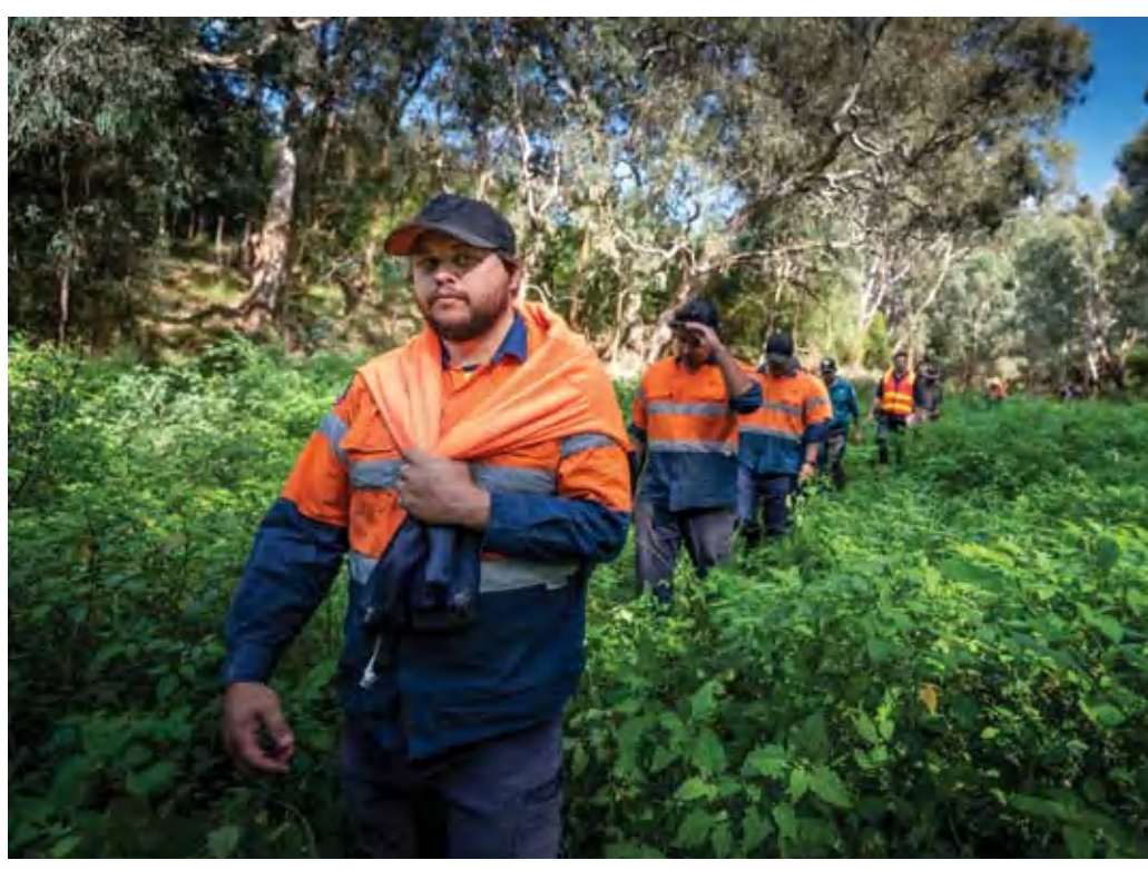
The Narrap Team have put Indigenous natural resource management on the map in their region.