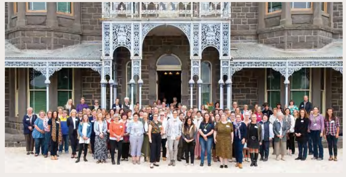
Members of the Corangamite Rural Women's Network at Barwon Park Mansion in 2019.

In 2014 the CMA fostered the formation of the Corangamite Rural Women's Network. The network brings rural women together to strengthen community resilience, empower them to contribute, be seen as equal, and to influence decision making both on and off farm.