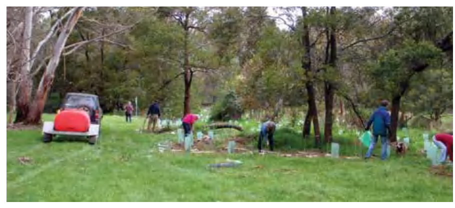
A Newham and District Landcare Group planting day at Hanging Rock.

More than 140,000 tubestock have been planted in the Cobaw Biolink with many of these provided by the Newham Primary School's propagating group (run by NDLG).