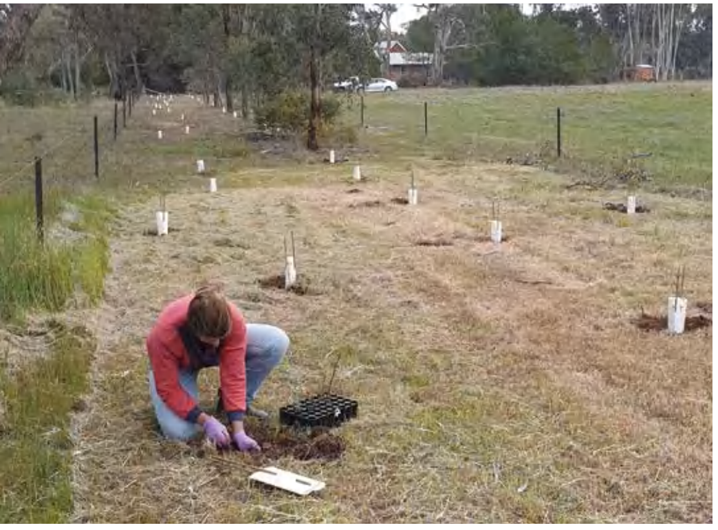
Completion of the Coonooer Bridge Community Hall Revegetation Project by local families in August 2020.

Regional biodiversity has been a focus activity for the network. Multiple biodiversity mapping surveys have been undertaken and in 2020 BNGLN contributed to the Great Southern BioBlitz project — a biodiversity mapping project for all countries in the southern hemisphere.