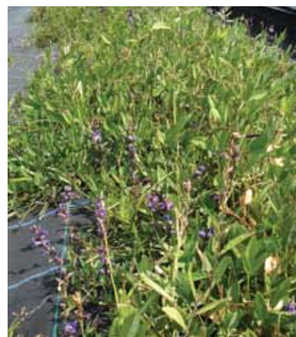
Variable Glycine is a depleted pea species that is difficult to collect in the wild. The Euroa Arboretum has turned a handful of original wild seed into a potential ten kilograms of seed each year.

This funding is for small- and large-scale grants to support local community projects focused on improving biodiversity, reducing/managing waste and cleaning up our coasts and waterways. I encourage Landcare groups and networks to access this grants fund, to help support them in