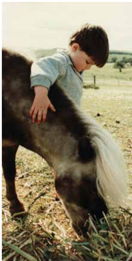
Existing networks such as pony clubs are valuable for promoting Landcare programs and events.

The Yarra Valley Equestrian Landcare Program has educated more than 200 property owners and many agency staff on the close links between horse health and behaviour and good land management.