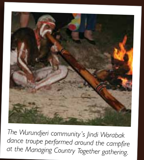
The Wurundjeri community's Jindi Worabak dance troupe performed around the campfire at the Managing Country Together gathering.