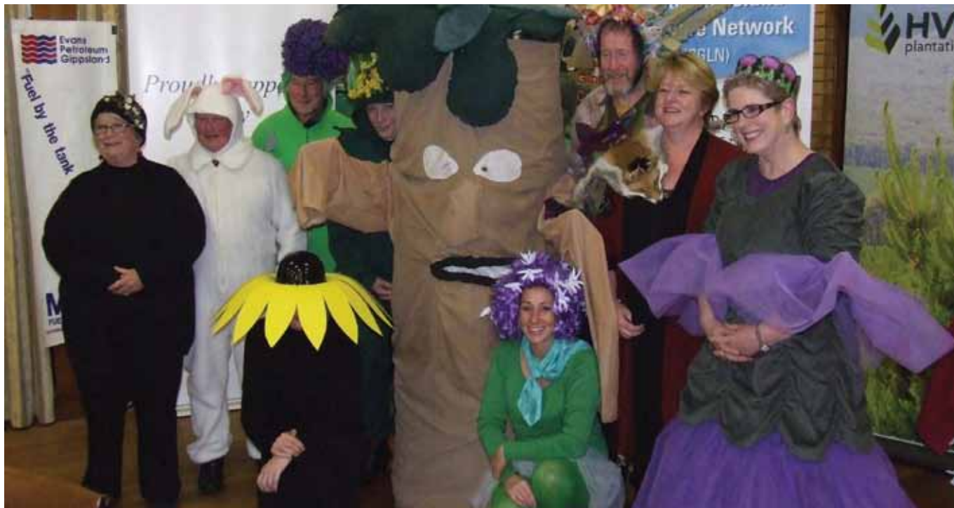
The South Gippsland Landcare Awards had a Friday the 13th theme. The Landcare folk believe the scariest things in the region are weeds and pest animals and this was reflected in their costumes.