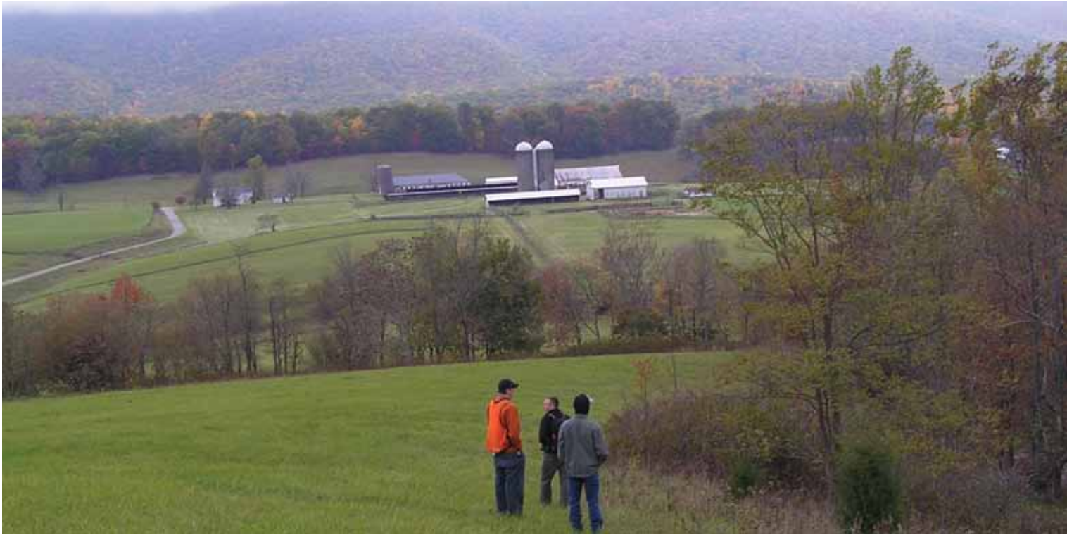
Silos at Catawba Farm with the Appalachian Mountains in the background.