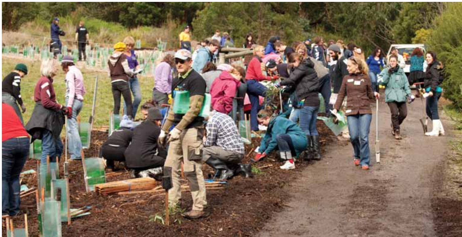
The second Landcare for Singles planting day attracted 85 people to Birdsland Reserve in Belgrave South. According to participants, it was a lot of fun, and a great way to meet new people.