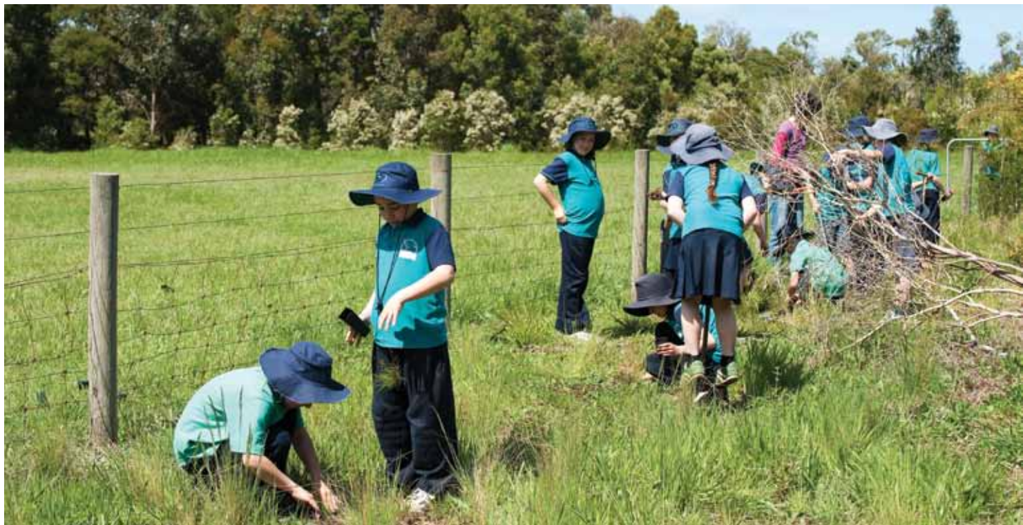
Students from Balnarring Primary School have improved their school grounds and recorded a huge increase in birdlife. In 1996 29 different bird species were recorded at the school. In 2008 this had increased to 84 species.