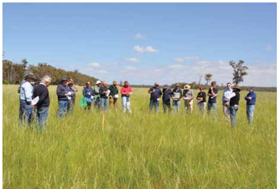
A drought-tolerant pastures field day at Charles Meckiff's property at Darriman.

Average annual rainfall is 600 millimetres, but the district has experienced drought conditions for the past three to four years. Despite the dry conditions in 2009 (the first year of the project), 15 paddocks were sown. The majority had good establishment results and all of the pastures survived their first summer.