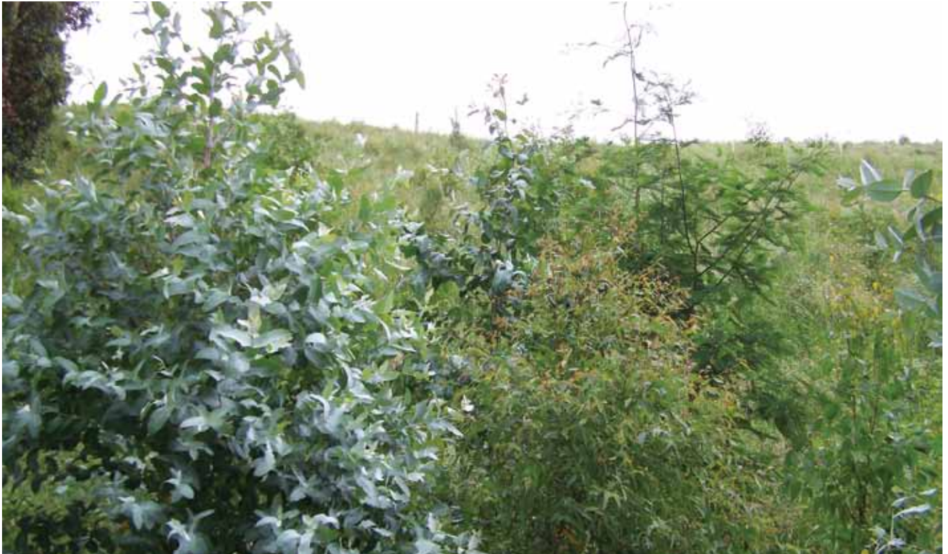
A good variety of species have germinated across the site.

One kilogram of seed went through a process of pre-germination. The remaining four kilograms of seed was mixed with 25 kilograms of sawdust as a bulking material prior to sowing. All the acacia seeds were heat treated, which involved soaking them in boiling water for 20 minutes prior to sowing. This process is called scarification and enhances the germination of hard-coated seeds like acacias.