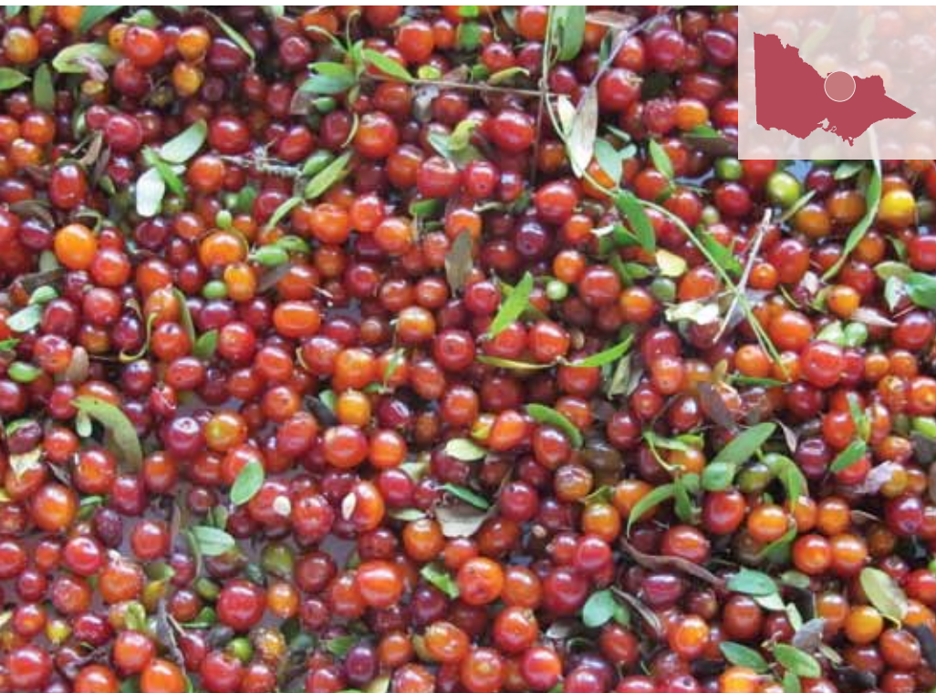
Stocks of Prickly Currant Bush at the Euroa Arboretum.

"Silver Banksia was once widespread across Victoria. It is now grossly depleted and completely absent from the northern half of the catchment. Historical records show that Silver Banksia was quite common. Early explorers often referred to the species in their journals as honeysuckle. These plants are pollinated by honeyeaters and were a great food source for nectar-dependent species like pygmy possums and regent honeyeaters, many of which are now virtually extinct."