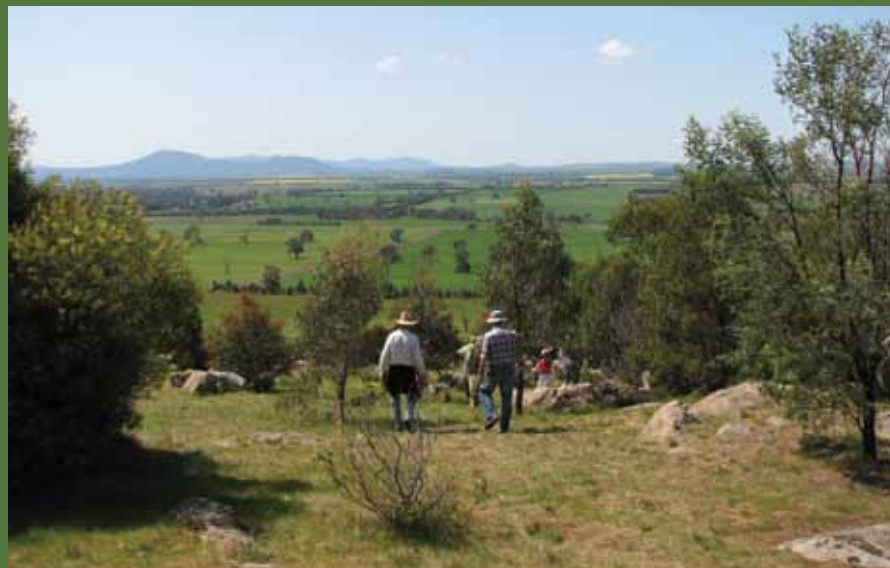
An Environmental Farmers Network field day looking at revegetating ridges in the Bullock Hills south of Ararat.

I am currently President of the Kaniva District Landcare Group, a member of the Victorian Landcare Council and on the Board of the Hindmarsh Landcare Network. I am also a member of the Environmental Farmers Network. Farming doesn't happen in isolation. Being connected to the wider community and learning from each other is very important.