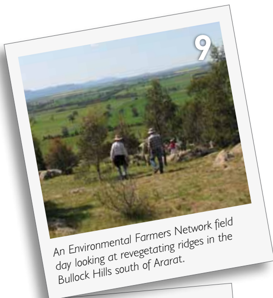
An Environmental Farmers Network field day looking at revegetating ridges in the Bullock Hills south of Ararat.

The State of Victoria acknowledges contributions made by private enterprise and other persons or groups interested in Landcare. Acceptance of these contributions, however, does not endorse or imply endorsement by the State of Victoria of any product, service, or view offered by contributors.