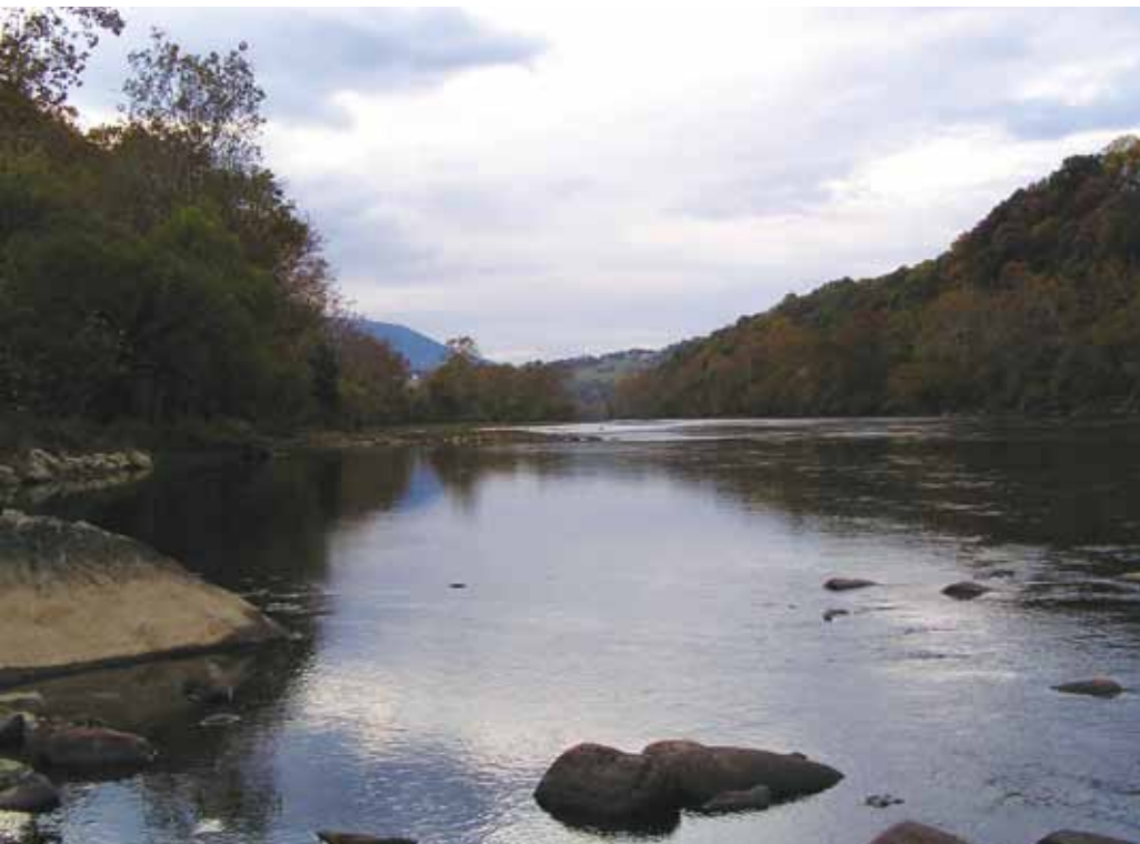
The New River, Virginia – a US heritage river.