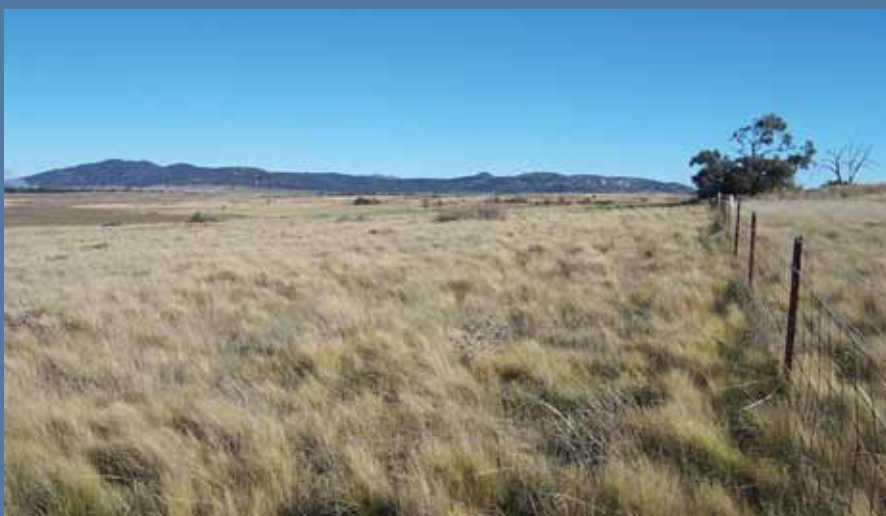
A grassland conference being held in November is aiming to improve biodiversity management within the Volcanic Plain Grasslands.

The Victorian Landcare & Catchment Management magazine is published by the Victorian Government Department of Sustainability and Environment and distributed in partnership with the Farm Tree & Landcare Association and the Victorian Catchment Management Council. The magazine aims to raise awareness of Landcare and natural resource management among Victorian farmers, landholders, the Victorian Landcare community and the wider community.