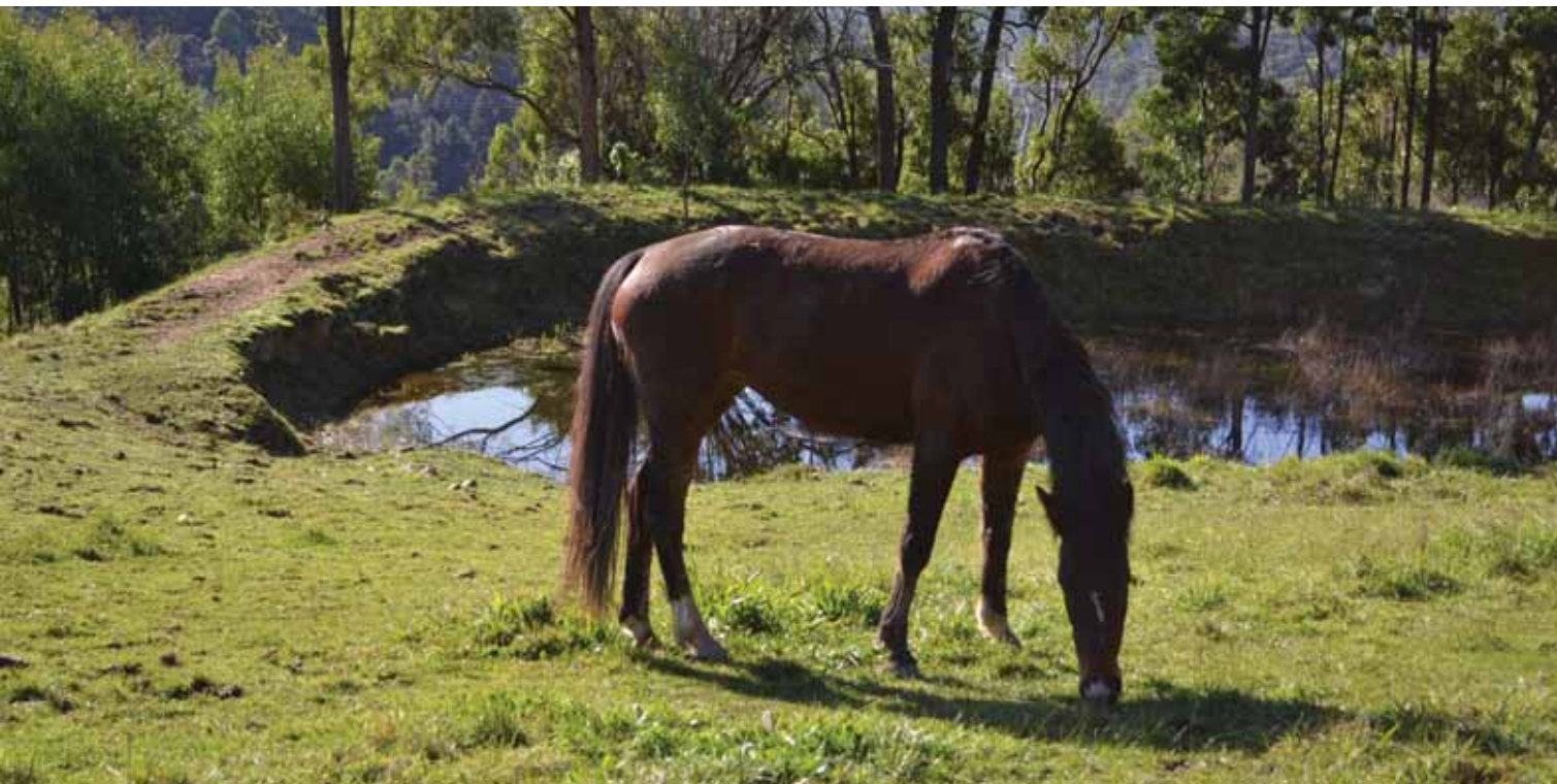
Horse owners in the Yarra Valley have been keen to learn more about soil, pasture and weed management on their properties.

health and sustainable land management, followed by a practical day led by the DPI Small Landholders team on property planning, with a practical soils, pastures and weed management component.