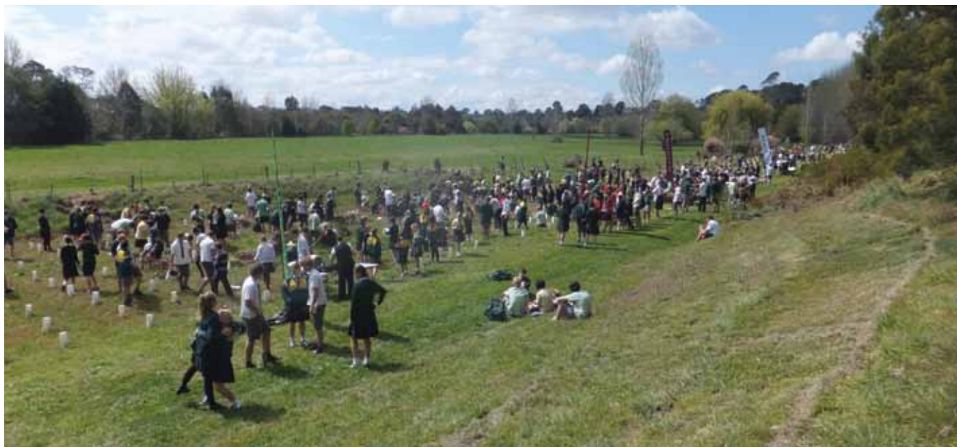
The Mitchell River Eco Warriors project aims to increase Nagle College students' awareness of nutrient runoff, erosion, deforestation, wildfire and native and pest plant and animal management.

"I hope what we teach these students will have a lasting impact and future generations can benefit from their knowledge and passion."