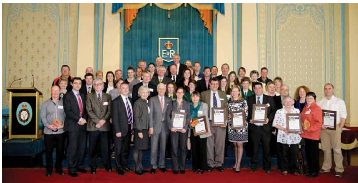
The winners of the 2013 Victorian Landcare Awards.