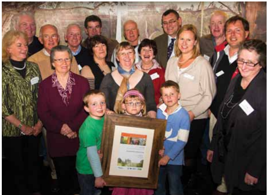
Members of the Pentland Hills Landcare Group accept the 2012 Port Phillip and Westernport Community Group Caring for Private Land Award.

PHLG seeks widespread input on their plans. They sought input from post-graduate research students, foresters