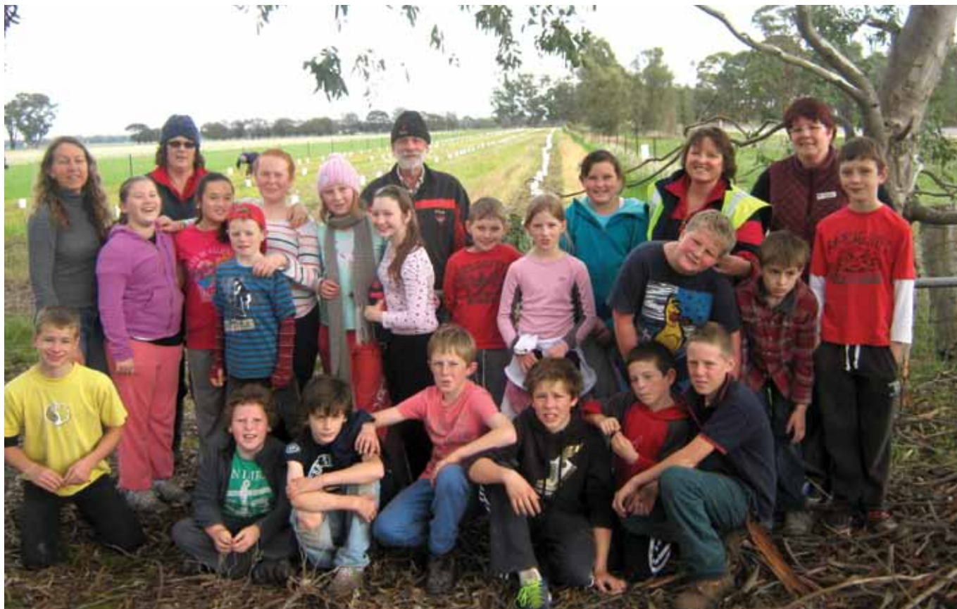
Laharum Primary students and members of the Laharum Landcare Group at a planting on National Schools Tree Day. Most of these students pass the planting site on the school bus every day so they will be able to watch the trees as they grow.

For further information contact Tony Kubeil on 5761 1619.