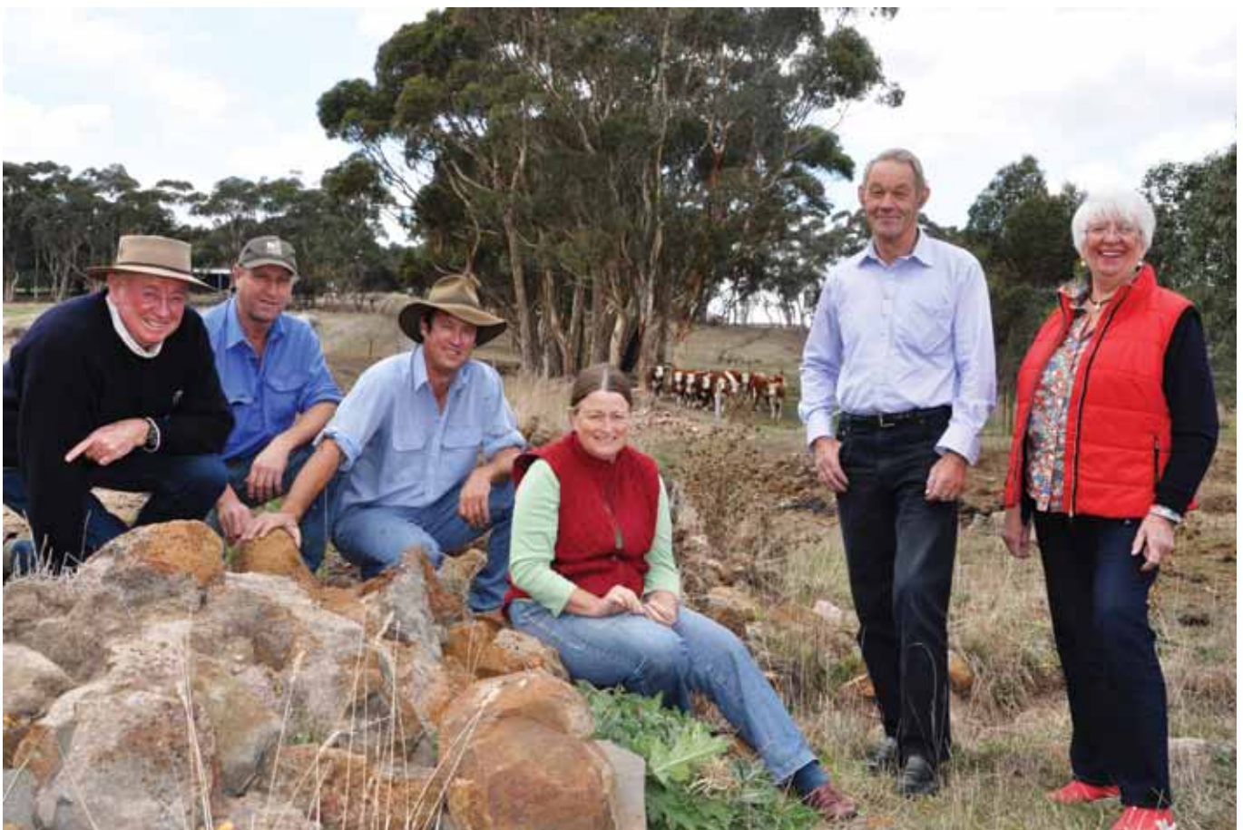
The Woody Yaloak Catchment Group is an example of productive catchment management and balancing productivity with environmental restoration.

The result of this approach is evident, with participation remaining above 50 per cent of membership in years when there was no money for grants. People remained engaged because of community and the effort undertaken by the group.