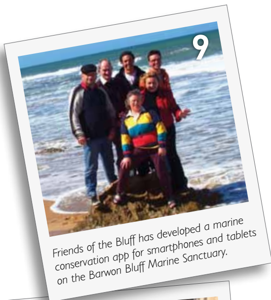
Friends of the Bluff has developed a marine conservation app for smartphones and tablets on the Barwon Bluff Marine Sanctuary.

The State of Victoria acknowledges contributions made by private enterprise and other persons or groups interested in Landcare. Acceptance of these contributions, however, does not endorse or imply endorsement by the State of Victoria of any product, service, or view offered by contributors.