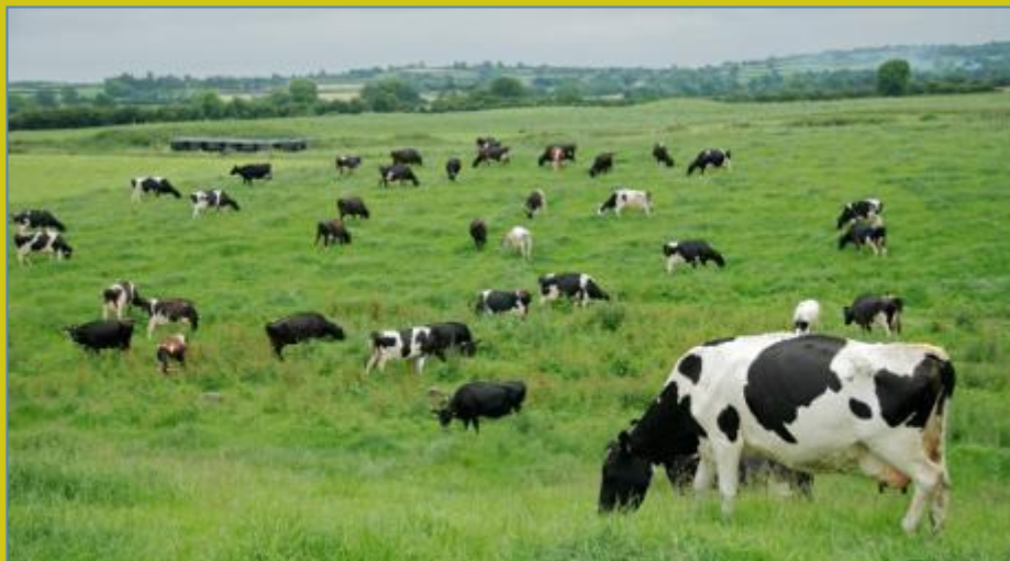
Dairying in Gippsland.

The rural consulting industry and soil testing laboratories have also directly benefited from increased servicing in the Gippsland region. Approximately $1.7 million profit (assuming a 30% profit margin) can be attributed to Landcare interventions.